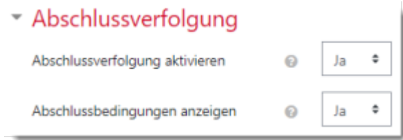
image: enable completion tracking

\ Enable in the course settings ( completion tracking section):